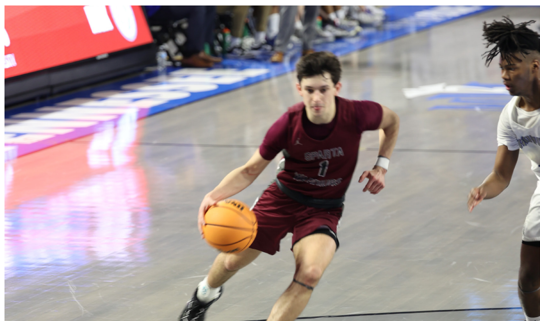
WCHS Warriors vs. Martin Luther King Jr. High School in first round of state tournament