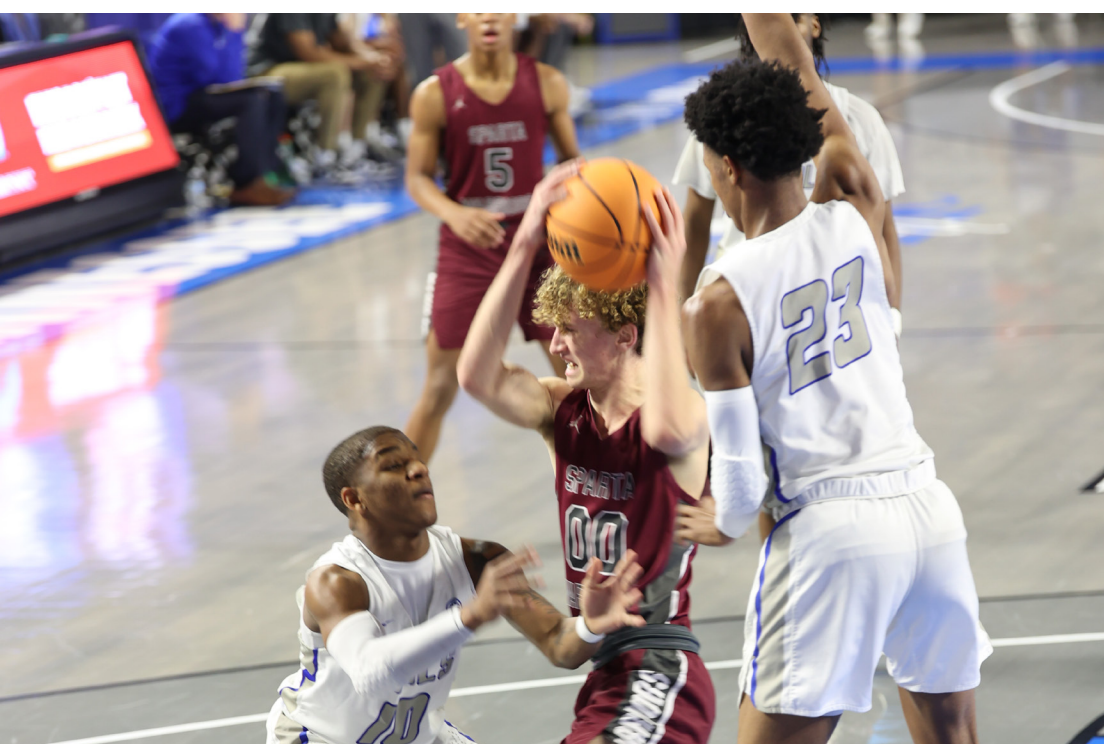
WCHS Warriors vs. Martin Luther King Jr. High School in first round of state tournament