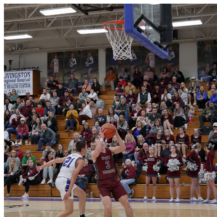
WCHS Warriors vs. Upperman in district matchup