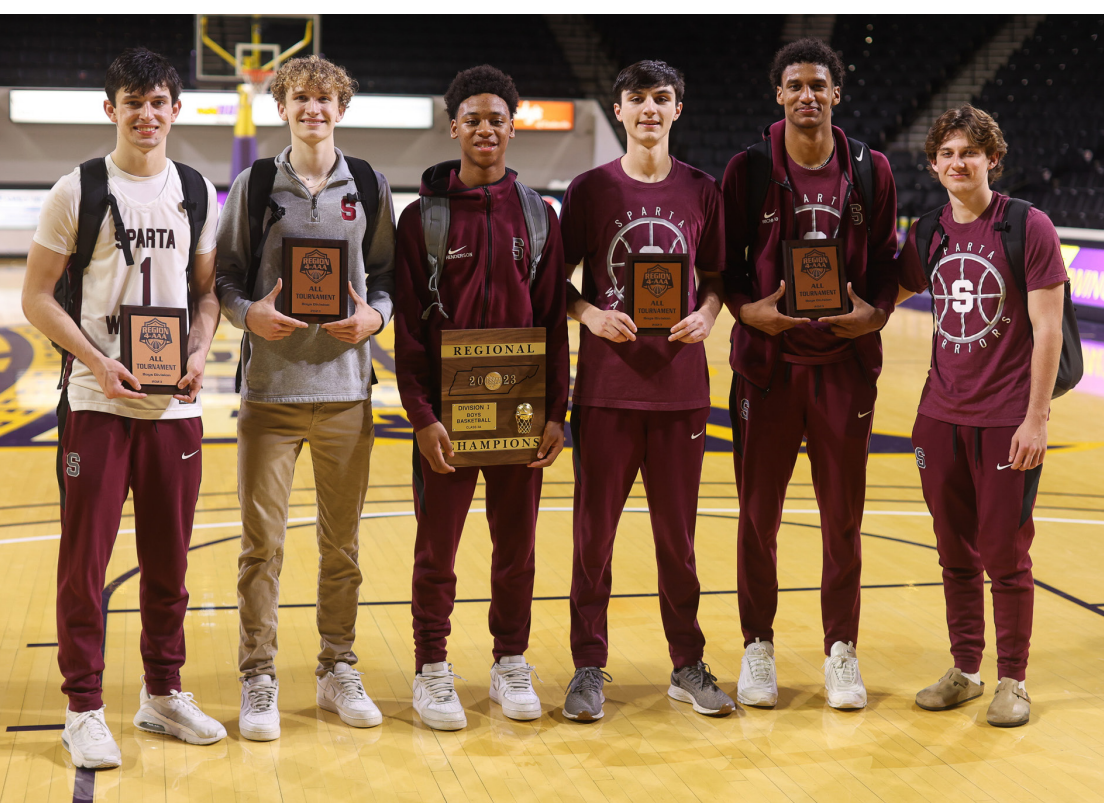
Seniors after region championship win