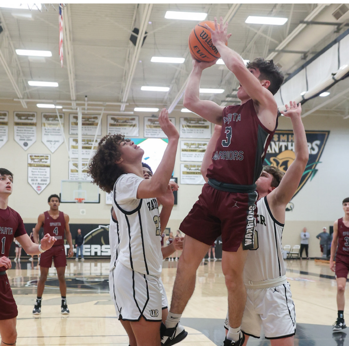
WCHS Warriors vs. Upperman in district matchup