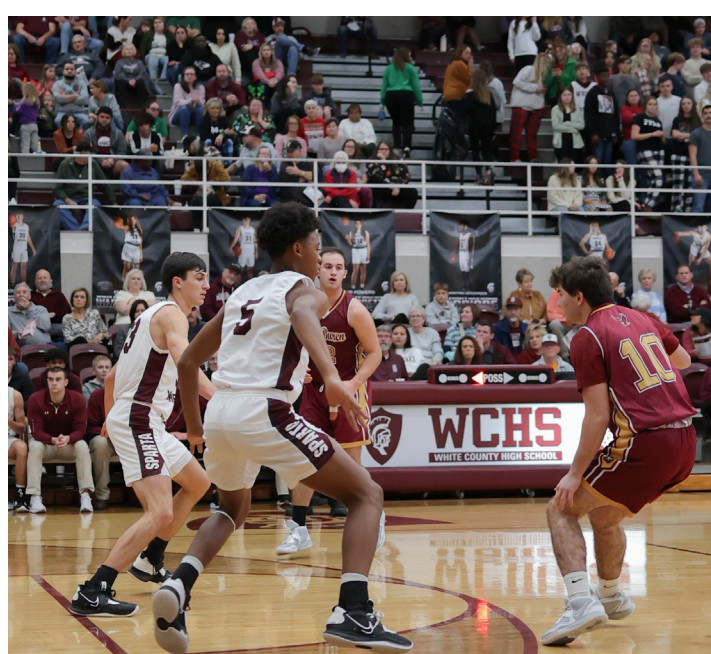
WCHS Warriors vs. Van Buren County in regular season action