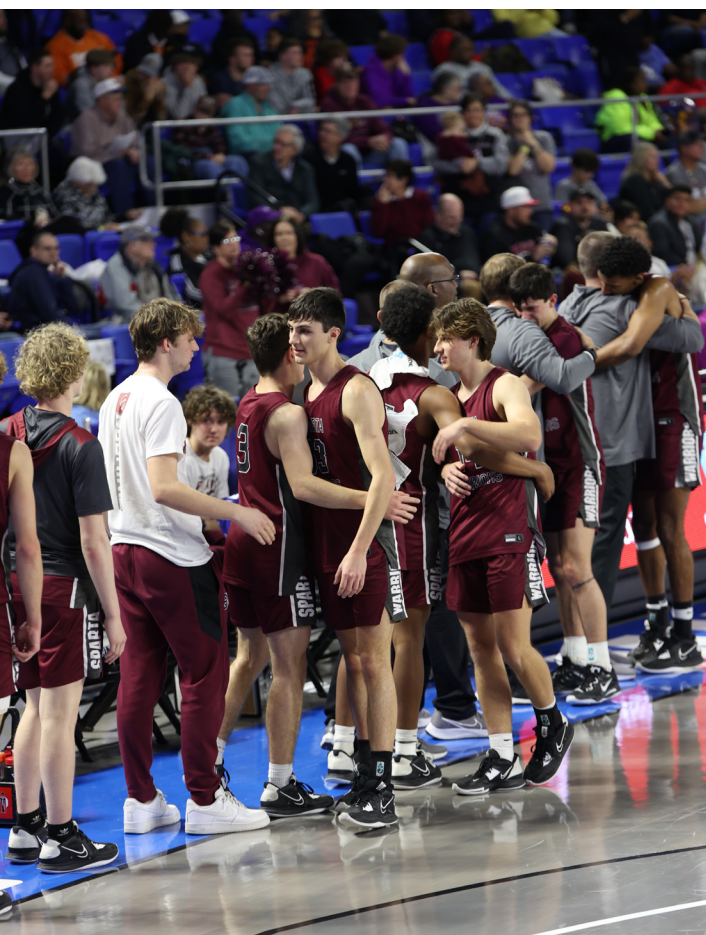
WCHS Warriors vs. Martin Luther King Jr. High School in first round of state tournament