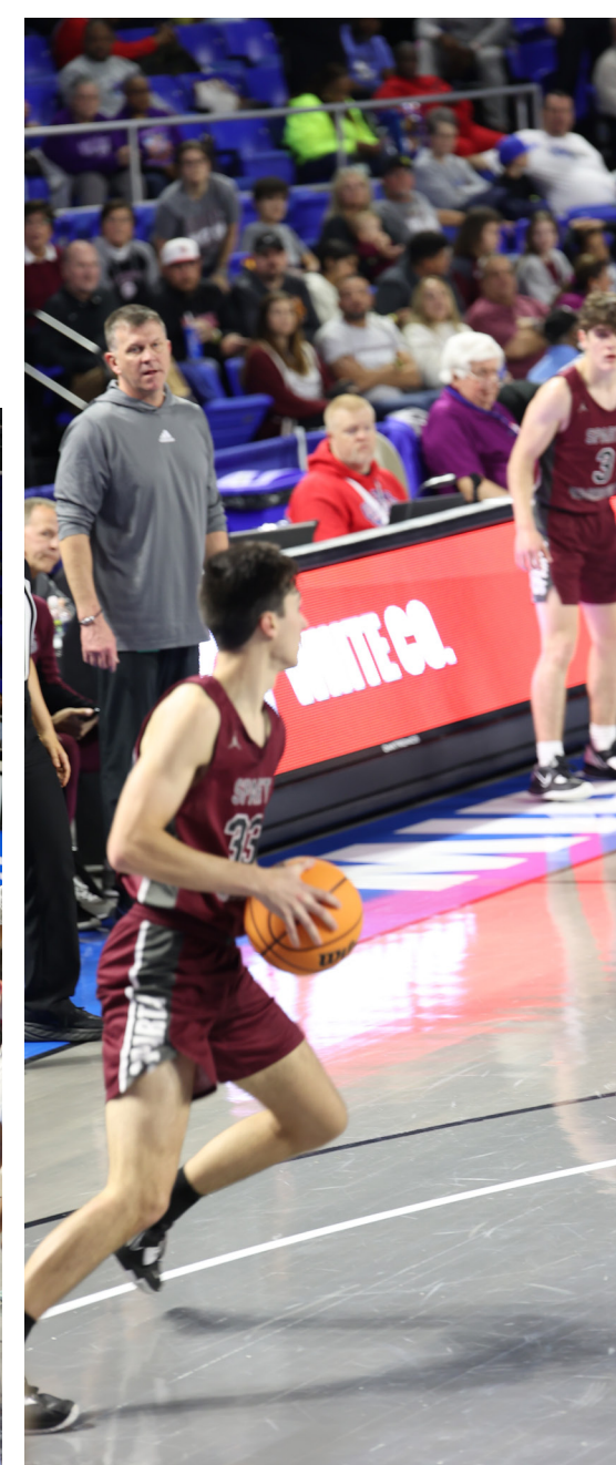
WCHS Warriors vs. Martin Luther King Jr. High School in first round of state tournament