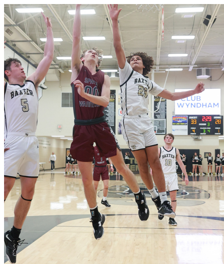
WCHS Warriors vs. Upperman in district matchup