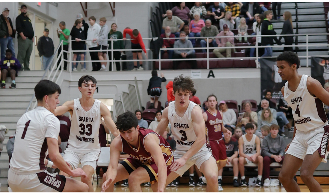
WCHS Warriors vs. Van Buren County in regular season action