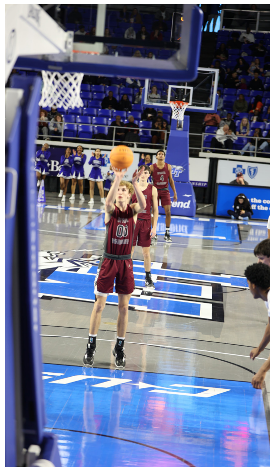
WCHS Warriors vs. Martin Luther King Jr. High School in first round of state tournament