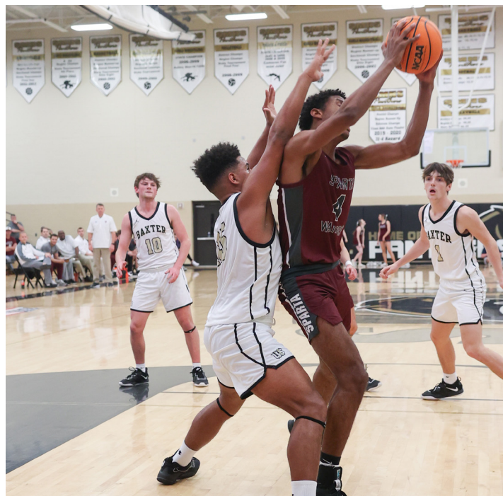
WCHS Warriors vs. Upperman in district matchup