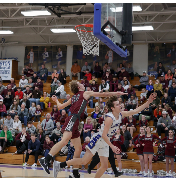
WCHS Warriors vs. Upperman in district matchup