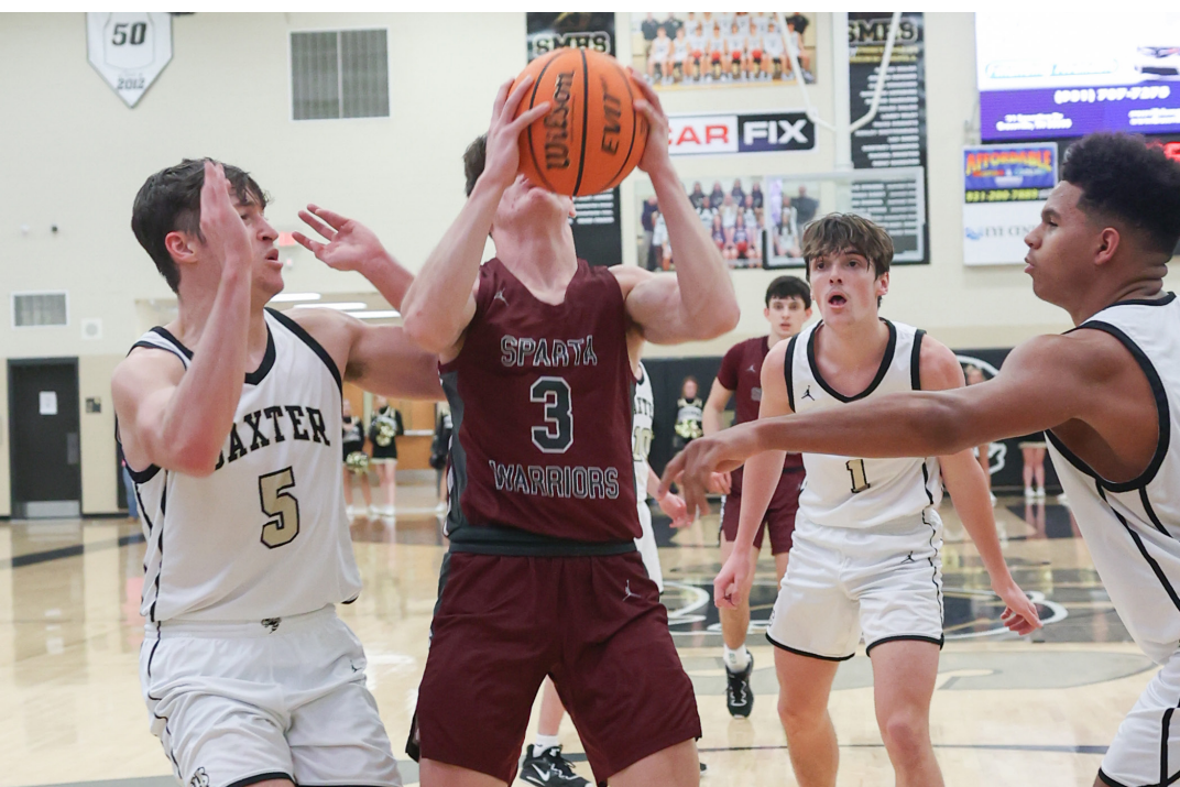
WCHS Warriors vs. Upperman in district matchup