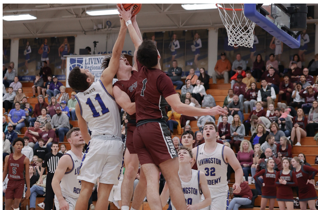
WCHS Warriors vs. Livingston