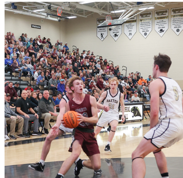
WCHS Warriors vs. Upperman in district matchup