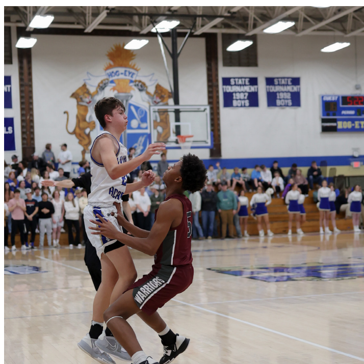
WCHS Warriors vs. Upperman in district matchup