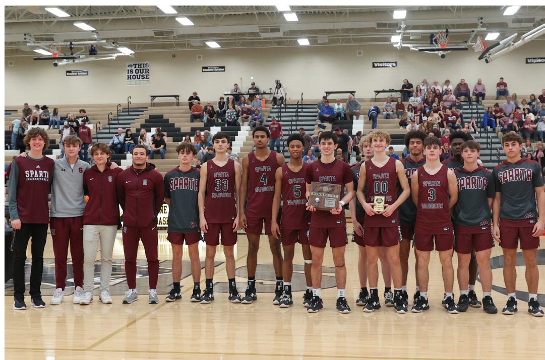
WCHS Warriors vs. Upperman in district matchup