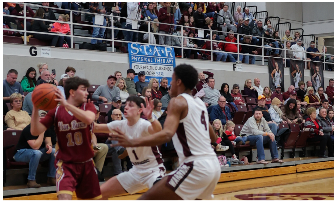
WCHS Warriors vs. Van Buren County in regular season action