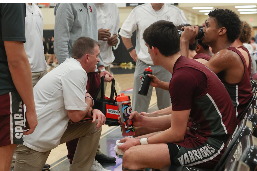
WCHS Warriors vs. Upperman in district matchup