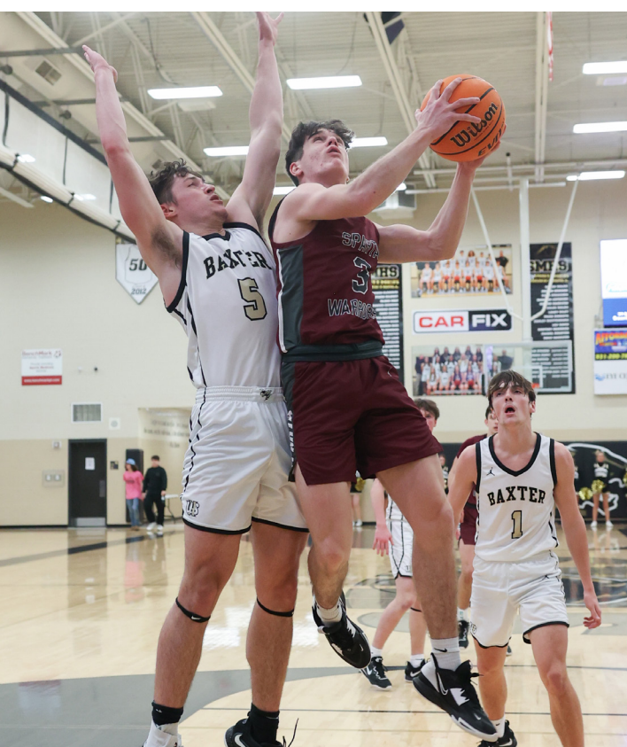
WCHS Warriors vs. Upperman in district matchup