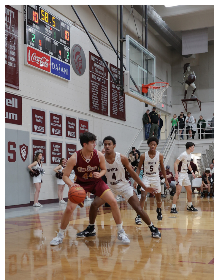
WCHS Warriors vs. Van Buren County in regular season action