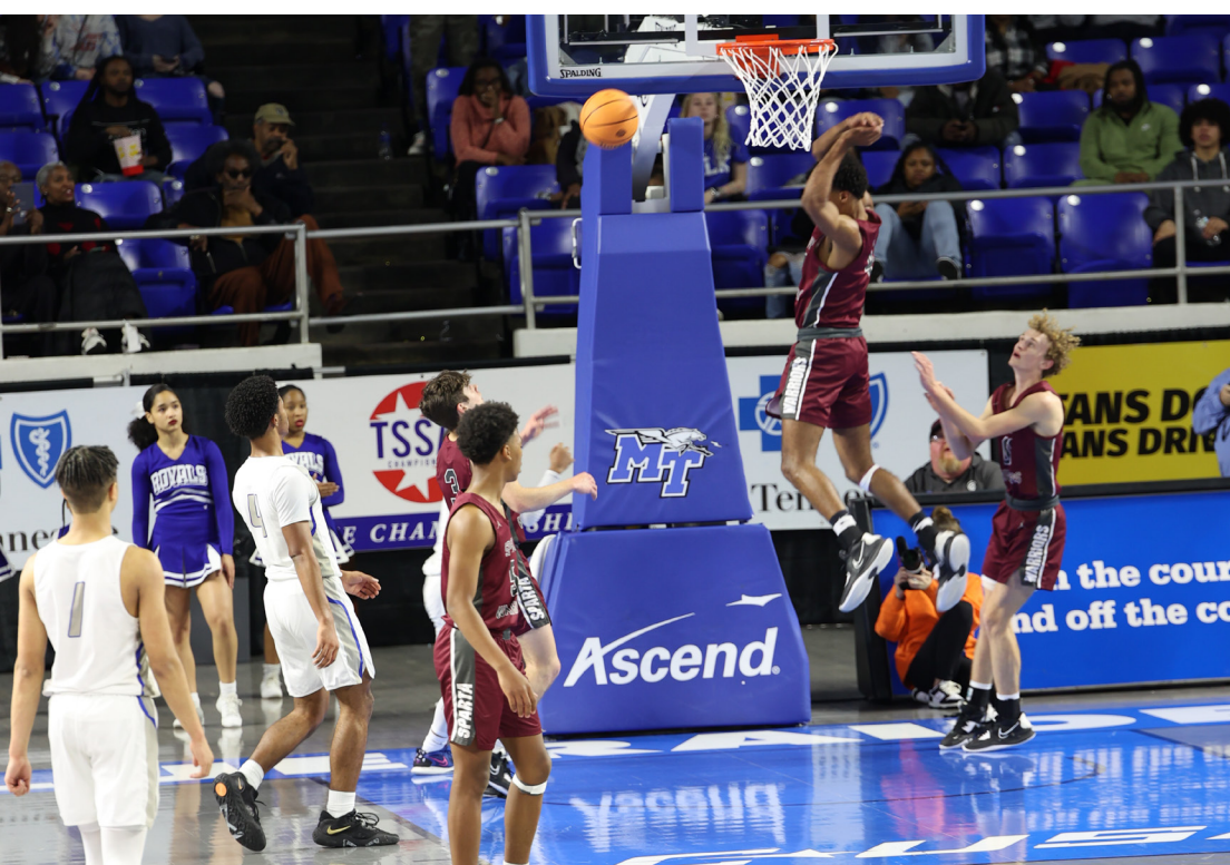
WCHS Warriors vs. Martin Luther King Jr. High School in first round of state tournament