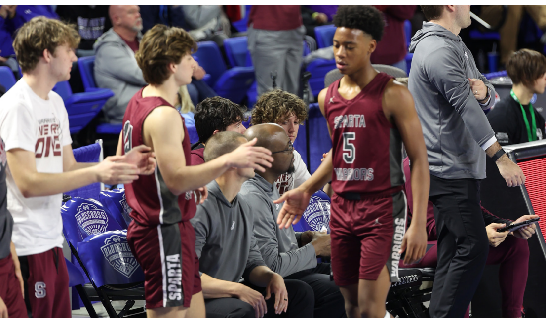
WCHS Warriors vs. Martin Luther King Jr. High School in first round of state tournament